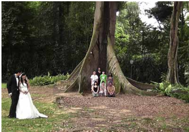
singapore, jungle fever, trip, home movie, botanic garden video stills - participants final voyage - video - 5'38