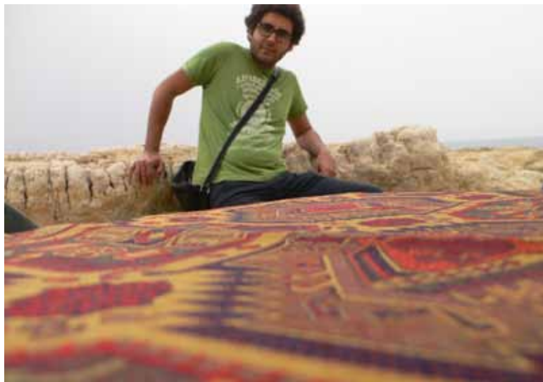
beirut, jungle fever, trip, postcard snapshots taken by participants become postcards of the destination set of 6 - 10.5x15 ms each