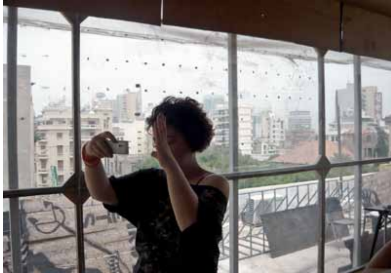
beirut, jungle fever, trip, postcard snapshots taken by participants become postcards of the destination set of 5 - 10.5x15cms each