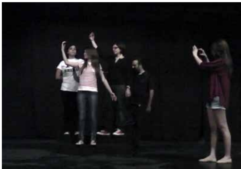
beirut, jungle fever, trip, home movie, martyr square video stills - participants final voyage - video - 9'50