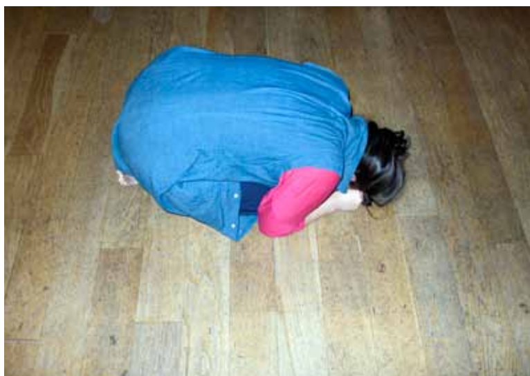
london, jungle fever, trip, postcard snapshots taken by participants become postcards of the destination set of 6 postcards - 10.5x15cms each