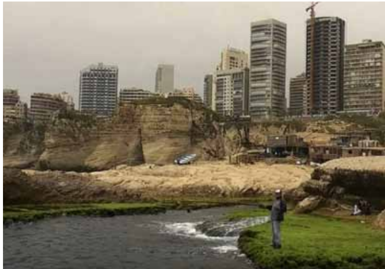
beirut, jungle fever, trip, home movie, Fellini video stills - participants final voyage - video - 6'22