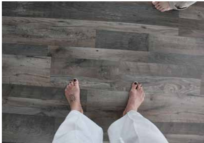
singapore, jungle fever, trip, postcard snapshots taken by participants become postcards of the destination set of 5 - 10.5x15cms each