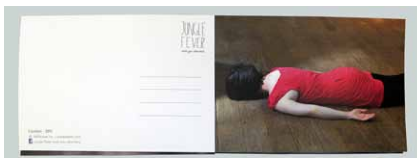
jungle fever, trip, postcard snapshots taken by participants in London, Beirut and Singapore a postcard book of 15 postcards in a clear cellophane bag with jacket 10.5x15cms each